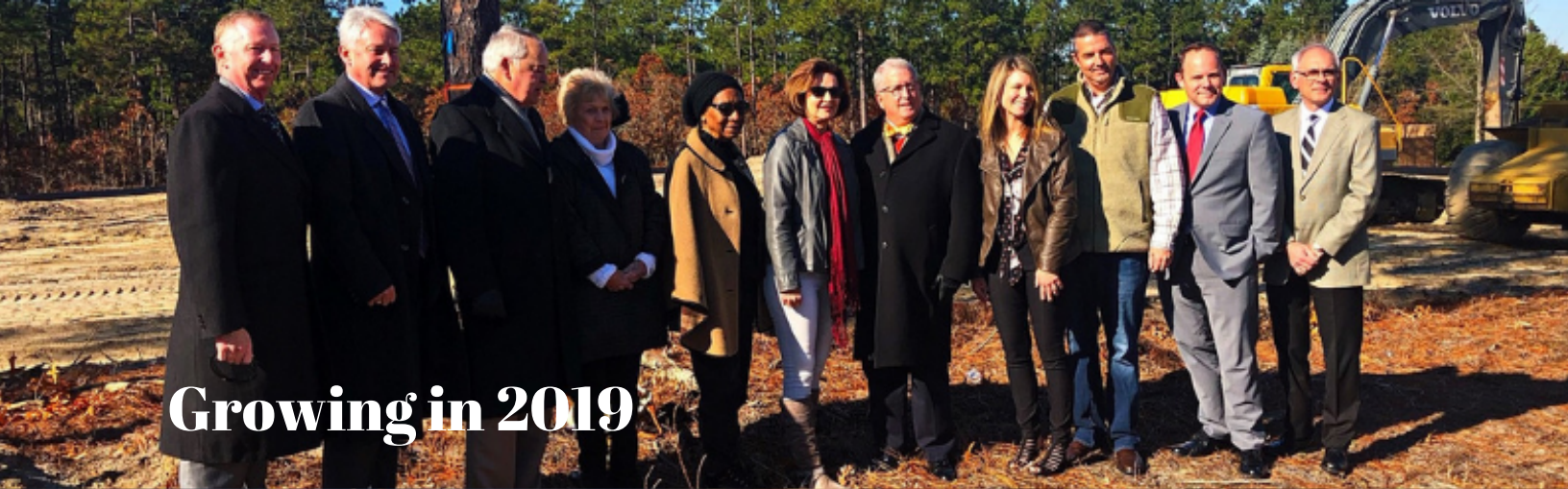
Growing in 2019